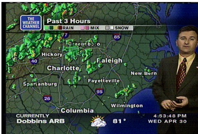
Previous display line over national

NOTE: The Lower Display Line during the "Local on the 8s" did not change.